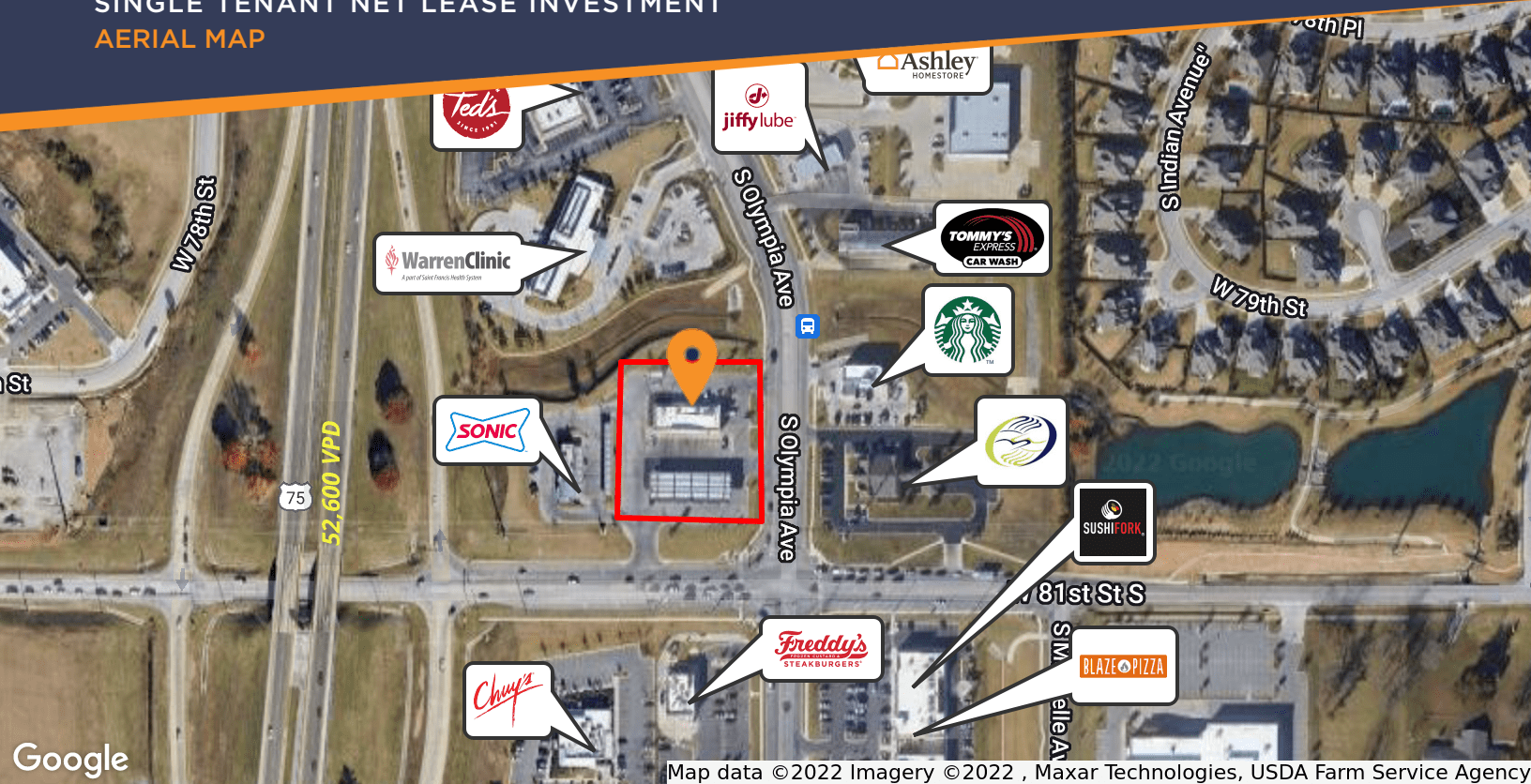
Map data ©2022 Imagery ©2022, Maxar Technologies, USDA Farm Service Agency