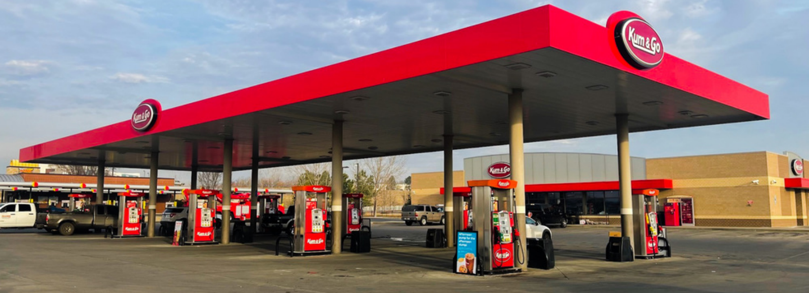
Actual Store Photo